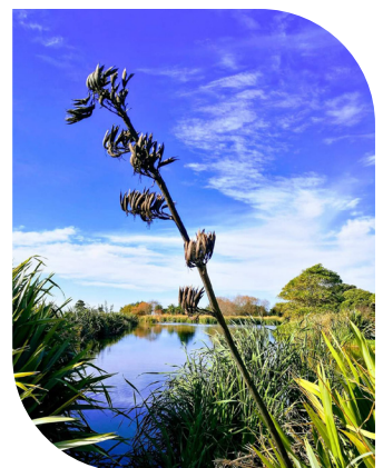
Above: The river taken from the "island". Thank you to all our Te Awanga planters and the children of Mangateretere School. Pai rawa tōu koutou mahi.