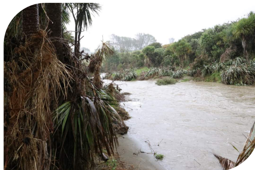
Above: The river in flood. A few trees were lost but of all Hawke's Bay's rivers the Maraetōtara was the least damaging to its environs.