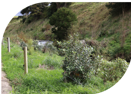
Above Left: Some lost, but many saved. Above Right: Some areas of our plantings were totally unscathed. Below Right: This winter's young trees, three months after planting.

tree species serve to filter out the nutrients that would otherwise enter the water, allowing the water creatures to thrive again. And the forty kilometre native tree corridor that we are creating is encouraging the passage of our native birds from the Cape Sanctuary to the bush remnants at the head of the valley. It is a big job, but with the help of the community and our many sponsors and supporters, we are getting there.