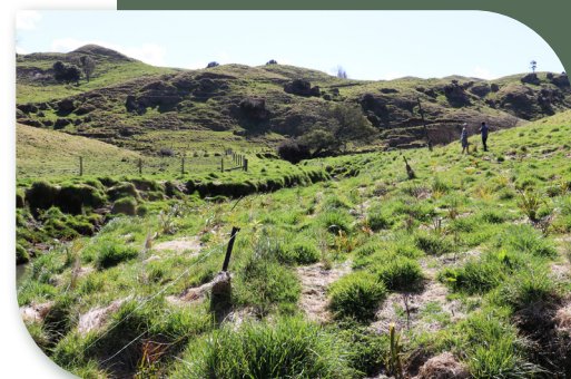
Riverbanks awaiting planting, upstream from the Maraetōtara Gorge Reserve